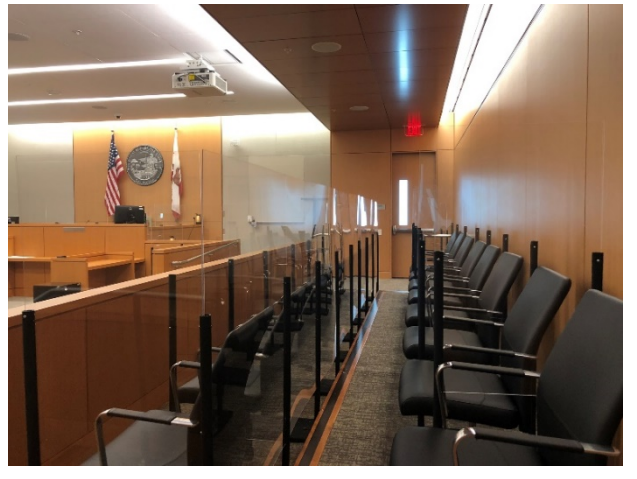
Additional protective partitions in the courtroom: