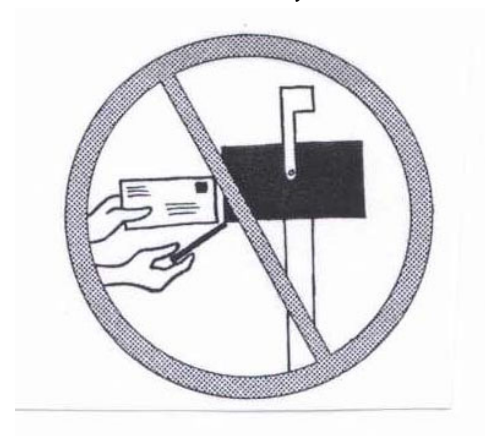
Don't serve it by mail!